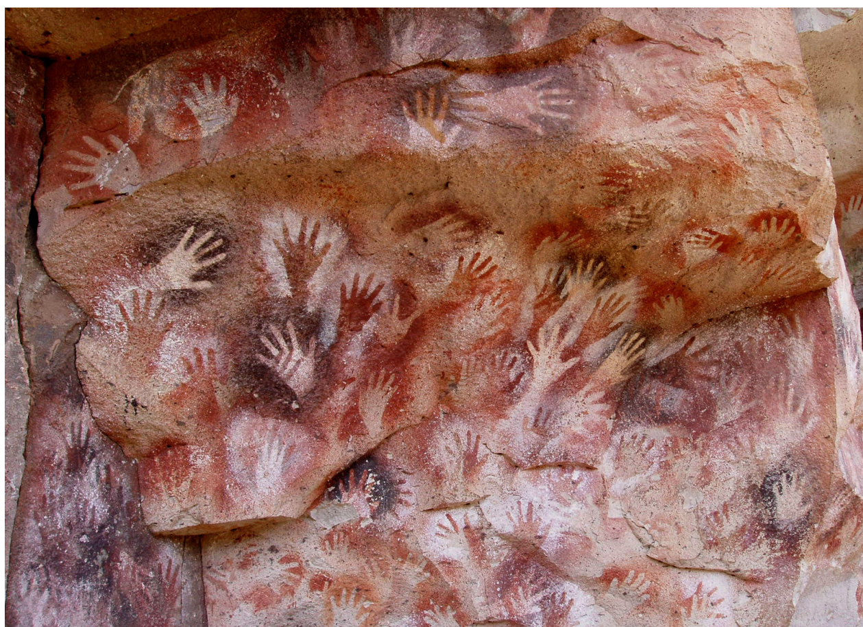
Cuevas de las Manos, Santa Cruz (Argentina)