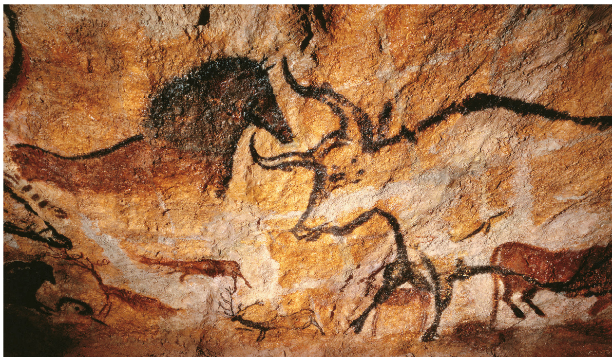
Grotte di Lascaux, Montignac (Francia)